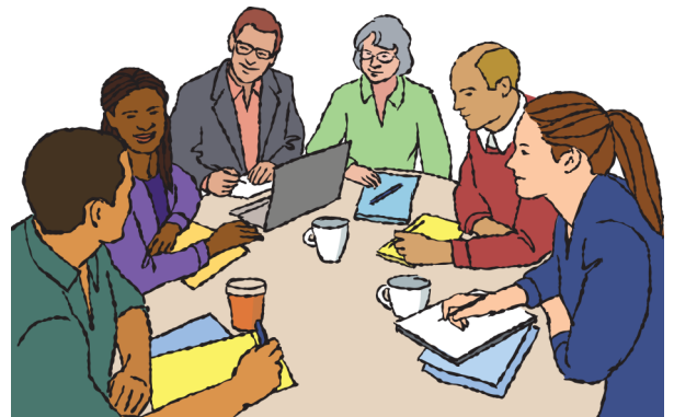
Church Council Meeting

Church Council meeting will be held on February 20th at 7:00 p.m. via zoom.